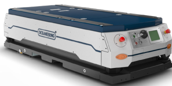
UniMover™ U 1500