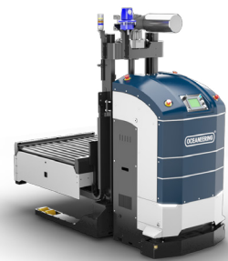
CompactMover™ Conveyor U 400