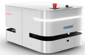
UniMover™ D 100

We can support your systems with OMR Supervisory Software that incorporates cloud, industrial internet of things (IIoT), machine learning, and big data technologies to present a streamlined view of operations to enable better decision-making. Additional support is available via our comprehensive Lifecycle Services that ensure the continuity and performance of our systems with quick, professional support anywhere in the world, 24/7.