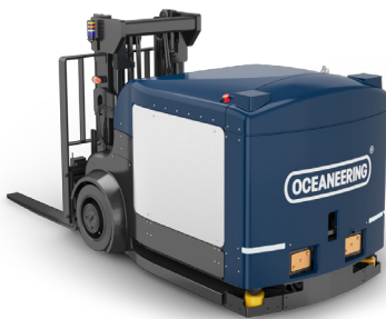
MaxMover™ CB D 2000

Our mobile robot systems consist of one or more robots from our forklift and underride families, advanced supervisory software, and supporting infrastructure. Integration management ensures that these turnkey logistic systems are optimized to suit customer needs and seamlessly interface with other processes.