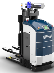
CompactMover™ FOL U 1200